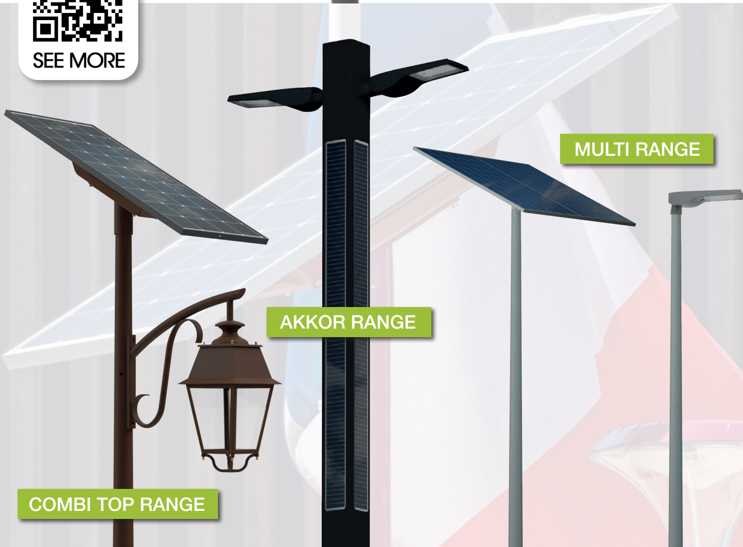
COMBI TOP RANGE